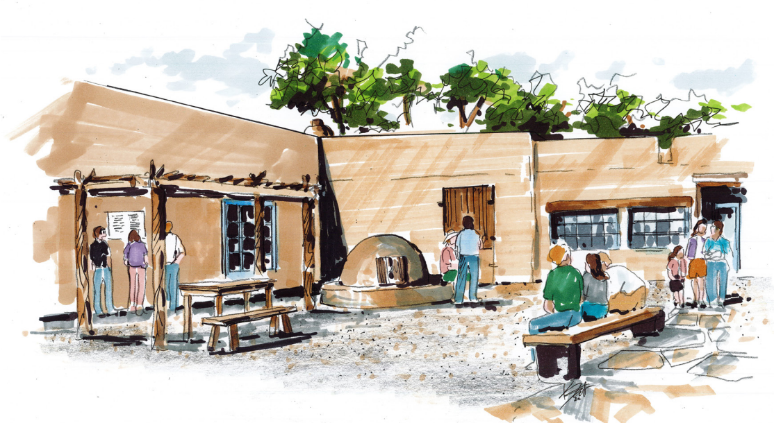
Graphic projection for the future look of the KCH courtyard by Conron & Woods

The rehabilitation of KCH will begin in the courtyard where architects have stressed that drainage is crucial. The courtyard will be graded away from the adobe structures so that moisture is directed toward a drainage system. Because moisture is the enemy of adobe, this is an important first step in protecting and preserving the buildings. As parts of the property are disturbed, there will be an archaeological review of any artifacts uncovered.