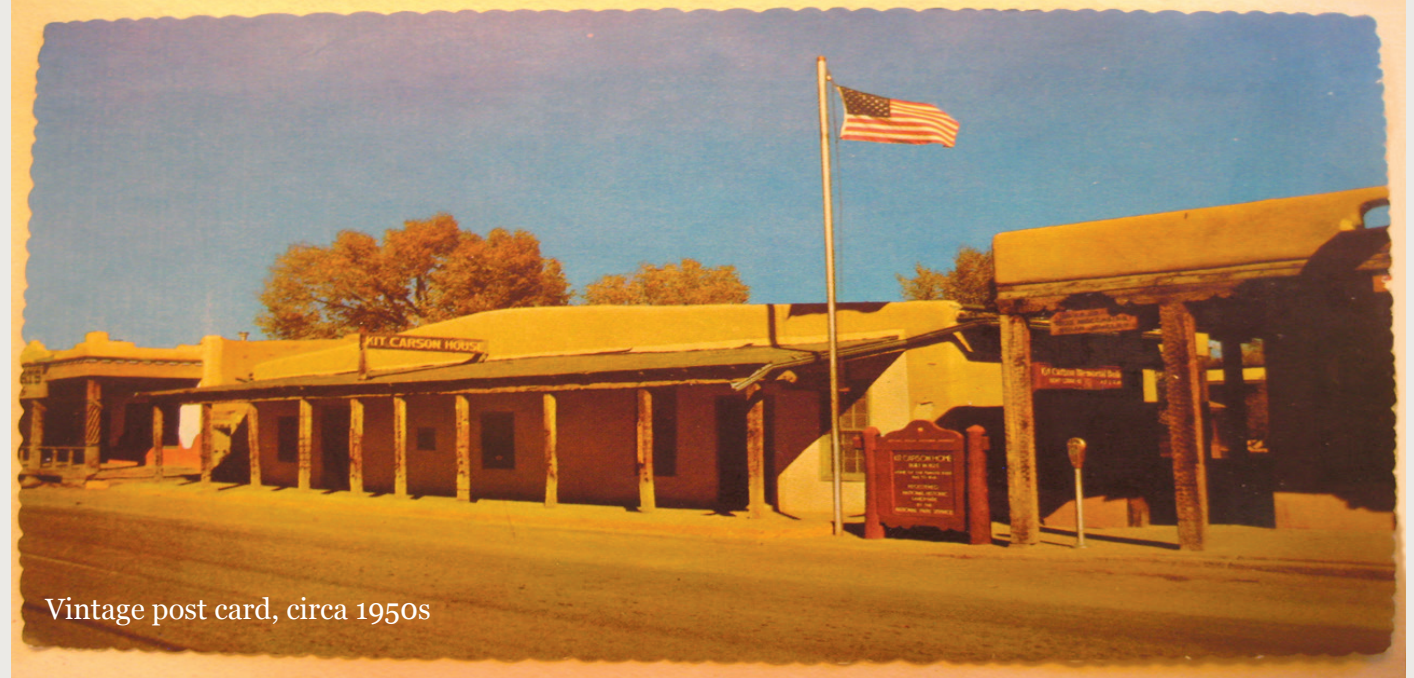
Photo by Bob Petley, Petley Studios Albuquerque, NM. In the early 1950s the Masons of Bent Lodge #42 opened the Kit Carson House to the public as a museum. Also during the 50s the lodge installed the flag pole to honor Kit Carson's service to America.

THE NEWSLETTER OF THE KIT CARSON HOUSE NATIONAL HISTORIC LANDMARK