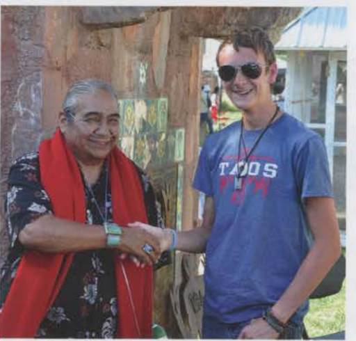
Photos from the KCHM 2014 summer fundraiser.

"As I started getting rich, I started thinking, 'What the heck am I going to do with all this money?' ... You have to learn to give." Ted Turner